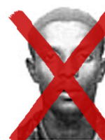
Fazul Abdullah Mohammed