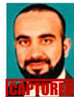
Khalid Shaikh Mohammed