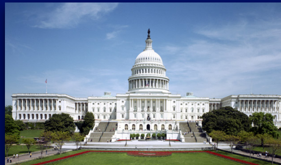
U.S. Capitol in Washington, D.C.