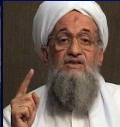
Ayman al-Zawahiri Believed to be living in this compound