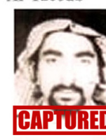
Ahmad Ibrahim Al-Mughassil