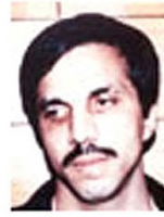
Abdul Rahman Yasin