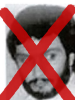
Imad Fayer Mugniyah