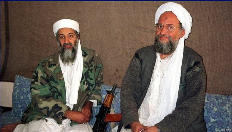
Zawahiri w/ Osama Bin Laden (1998)

America's withdrawal from Afghanistan has seemingly empowered Zawahiri & al-Qaeda