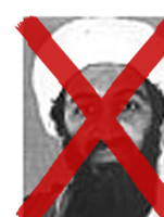
Osama Bin Laden