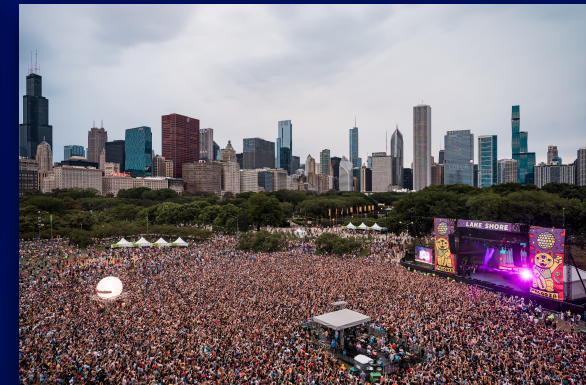
Music festivals across the United States