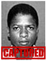
Ahmed Khalfan Ghailani