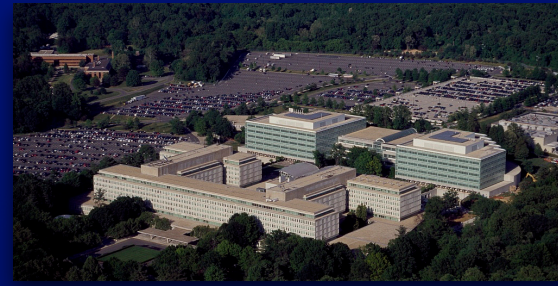
CIA Headquarters in Langley, VA